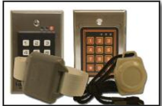
Wide variety of triggering devices available