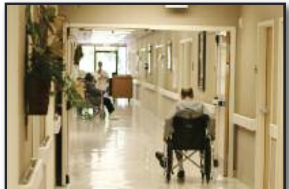
Provides worry-free protection for Alzheimer or Dementia patients